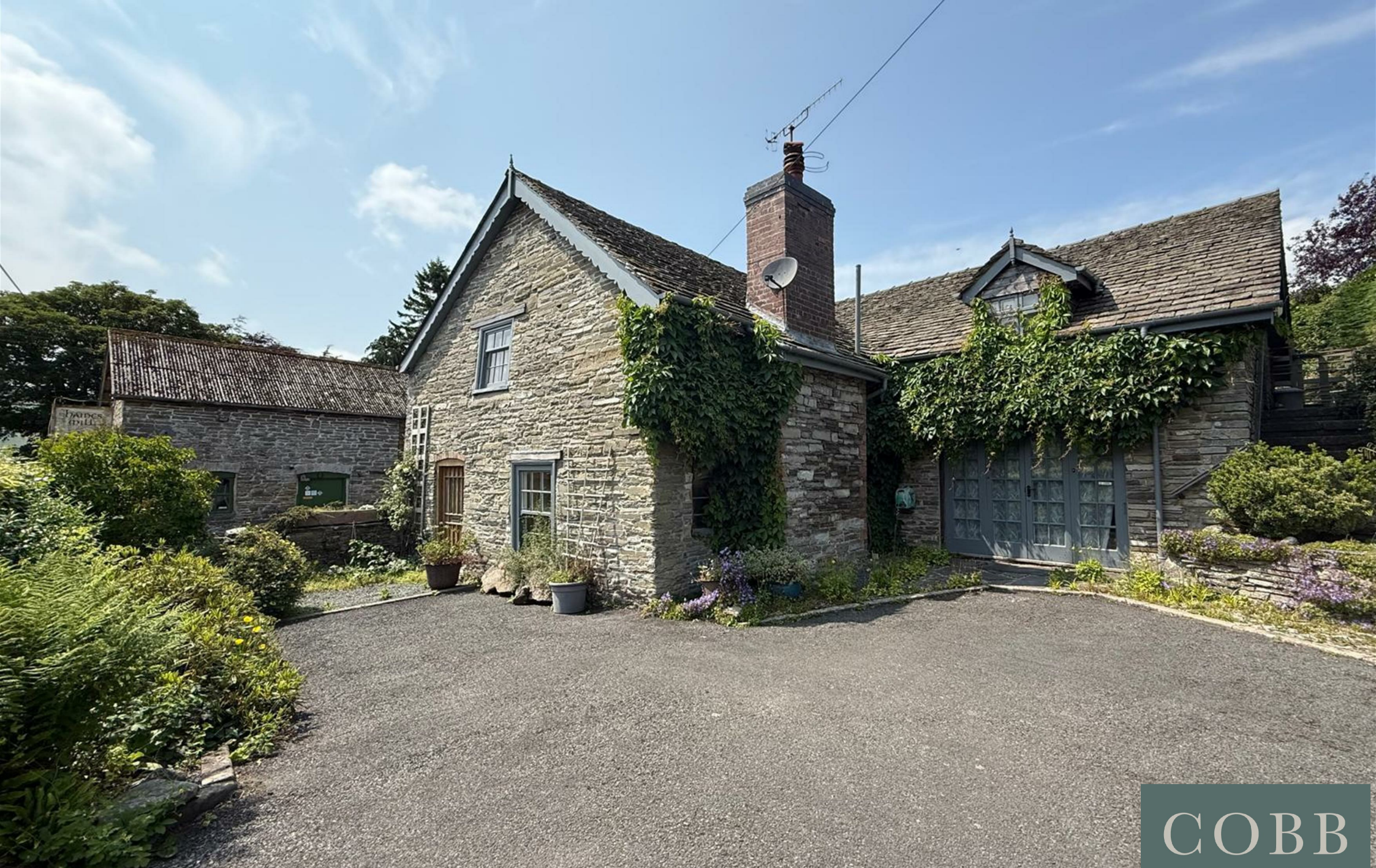
Haines Mill, House and Detached Barn, New Radnor, LD8 2TN Offers In The Region Of £475,000